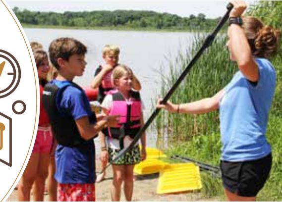
LOW STAFF TO PARTICIPANT RATIOS