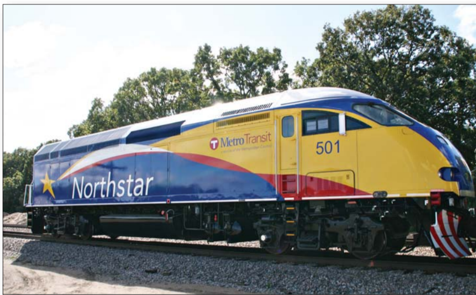
The first of five Northstar Commuter Rail locomotives was delivered to the Northstar vehicle maintenance facility in Big Lake.

For more information, visit www.mn-GetOnBoard.com .