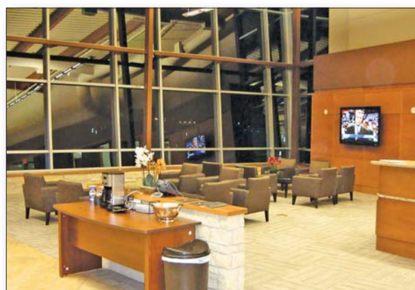
The executive terminal at the new FBO at the Anoka County-Blaine Airport.

Located just 15 minutes from downtown Minneapolis, the new facility also includes a 66,000 square foot hangar. “With the new FBO and other