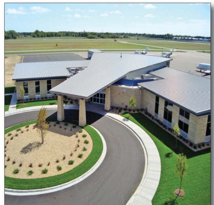
Exterior of the new FBO at the Anoka County-Blaine Airport.

Republican National Convention held in St. Paul in September. The new hangar at the airport also served as the site of a campaign rally for presidential candidate John McCain and his running mate Governor Sarah Palin. A crowd estimated at more than 13,000 attended the September rally.