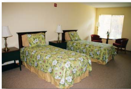
The guest suite at the Oaks of Lake George

The Oaks is located at 21202 Old Lake George Blvd. in Oak Grove. For rental information, contact Great Lakes Management at 763-753-8385.