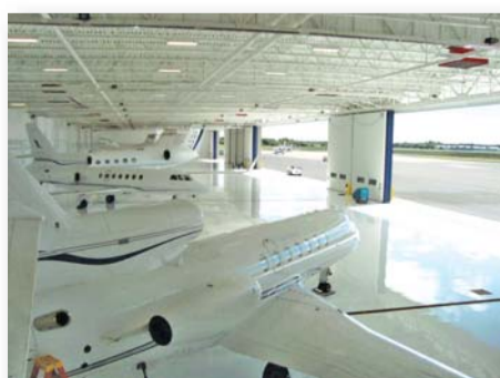
Interior of one of the new hangars at the Anoka County-Blaine Airport

Anoka County 2100 Third Ave. Anoka, MN 55303-2265