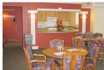
The spacious community room at the Oaks of Lake George.