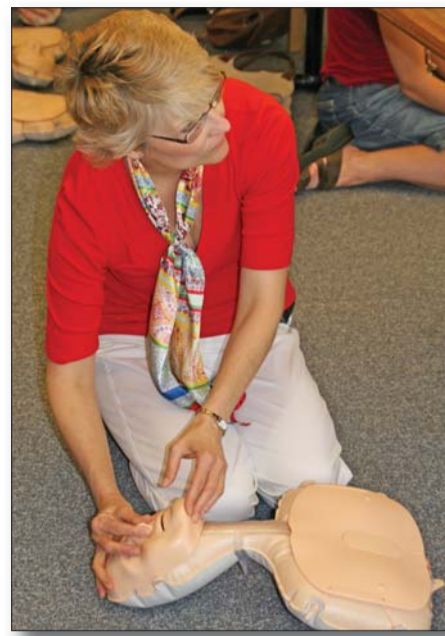
County initiative hopes to increase survival rates.

An estimated 350,000 people in the U.S. die from sudden cardiac arrest annually. The survival rate for sudden cardiac arrest is low -- just five percent. If untreated, death results in as little as six minutes from the time of collapse, rarely enough time for emergency responders to arrive. By training more people in CPR and having more AEDs available in public places, the Take Heart Anoka