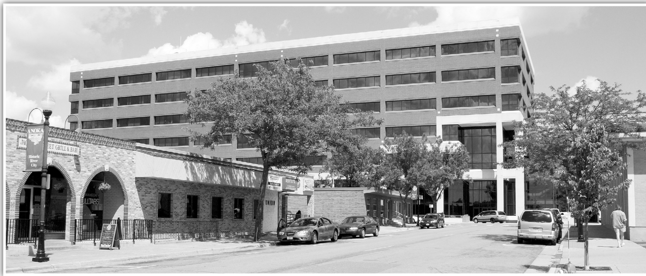
A view of the Anoka County Government Center from Jackson Street.

A FULL AND COMPLETE COPY OF THE COUNTY'S COMPREHENSIVE ANNUAL FINANCIAL STATEMENT IS AVAILABLE UPON REQUEST BY CALLING (763) 323-5700, BY WRITING TO THE COUNTY ADMINISTRATOR, ANOKA COUNTY GOVERNMENT CENTER, 2100 THIRD AVENUE - ROOM 700, ANOKA, MINNESOTA 55303 OR THROUGH OUR WEB SITE AT WWW.CO.ANOKA.MN.US .