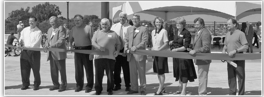
Ribbon-cutting ceremony for the Highway 65 and County Road 14 interchange project.

Transportation is a priority in Anoka County. Infrastructure such as railroads, airports, and freeways has a significant impact on economic growth. The County is served by three interstate highways: I-35W from downtown Minneapolis, I-35E from downtown St.