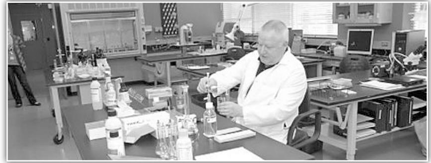
The Regional Forensic Lab opened in January, 2010.

The development of creative partnerships has been a key component of Anoka County's success. The County celebrated the latest example of its collaborative efforts with the January 2010 grand opening of the Anoka County Sheriff's Office and Tri-County Regional Forensic Laboratory. This new facility consolidates the majority of the Sheriff's Office operations, allowing officers to respond to emergencies more quickly and resulting in communication that is more efficient and streamlined. The state of the art forensic laboratory was made possible by a joint powers agreement between Anoka, Wright, and Sherburne Counties. The facility also features a unique agreement with Hamline University in St. Paul to offer practical experience and