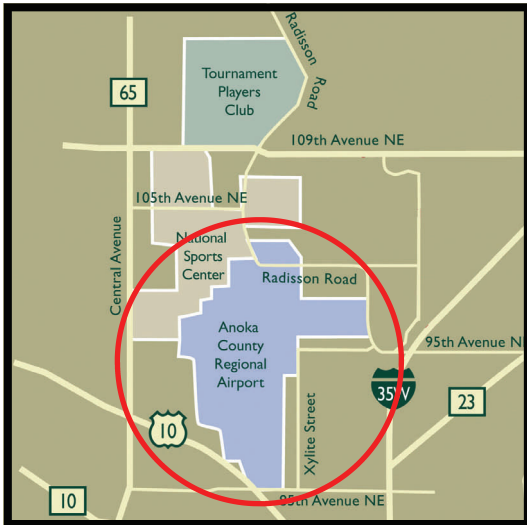
Located between Highway 10 and Interstate 35 W.

* The county will lease the 40-acre development area on the northwest side of the airport from the MAC for a 30-year period, and sublease the hangar area to Anoka Airport Development LLC, which will develop hangars and lease them to aircraft owners and commercial operations.